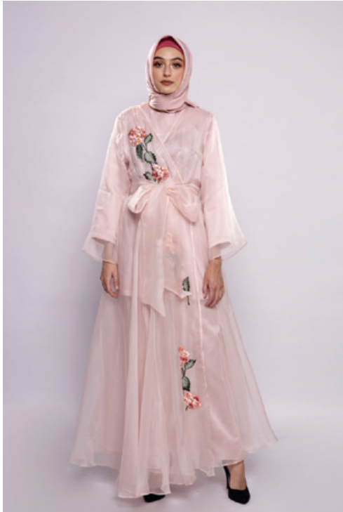
ORGANZA PINK DRESS 993.81 AED PINK INNER TOP 227.69 AED LONG PANTS 291.53 AED SATEN HIJAB 151.07 AED