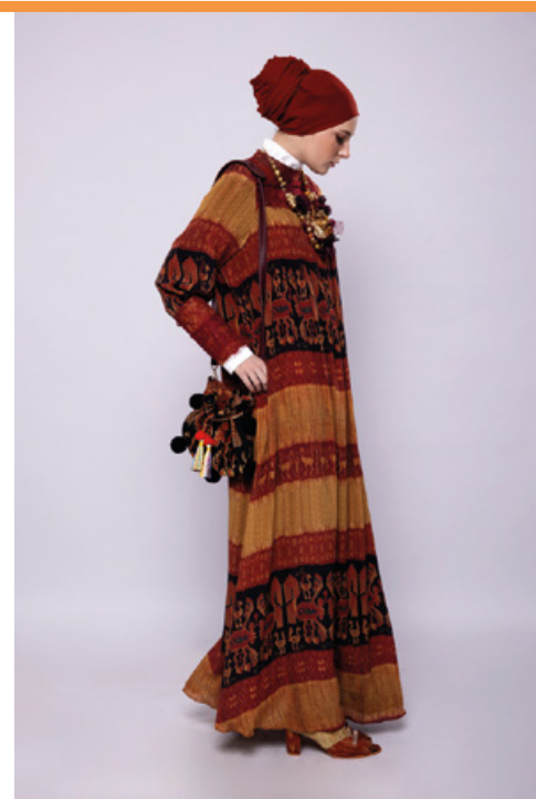
LOOK 6 (OUTFIT ONLY) 1500 AED