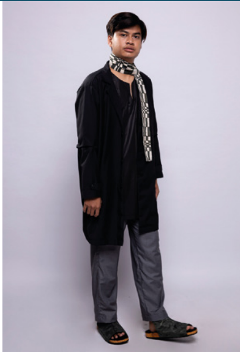
LONG BLAZZER BLACK TOP BLACK PANTS GREY MINI SHAWL 483.06 AED