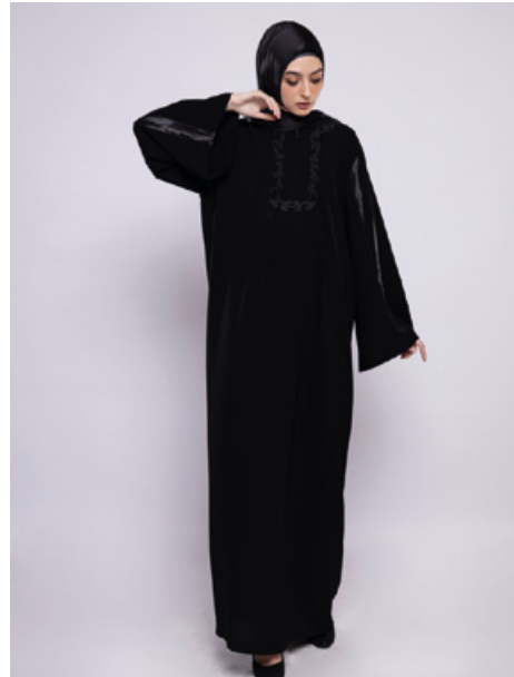
SUMAYYAH DRESS 546.91AED