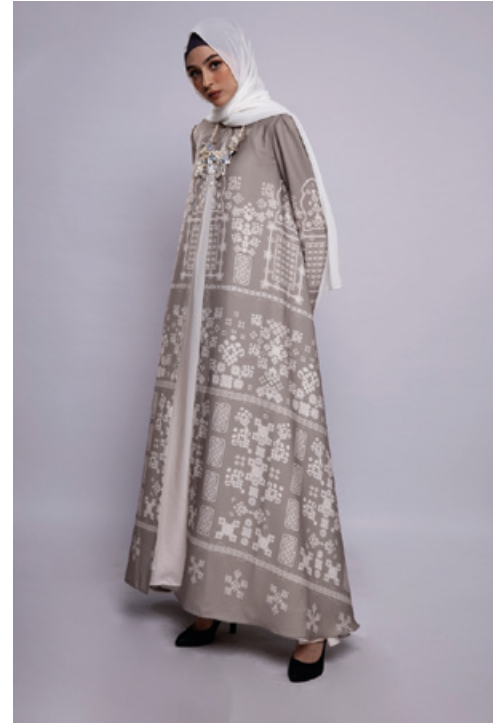
AMY DRESS 317.44 AED