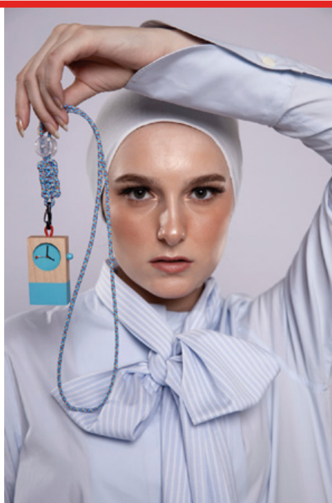
PALA GAWAI CYAN TALI PANJANG BABY BLUE