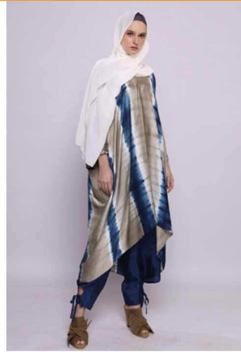
KAFTAN WITH SHIBORI 738.44 AED ANKLE PUFF PANTS 317.07 AED