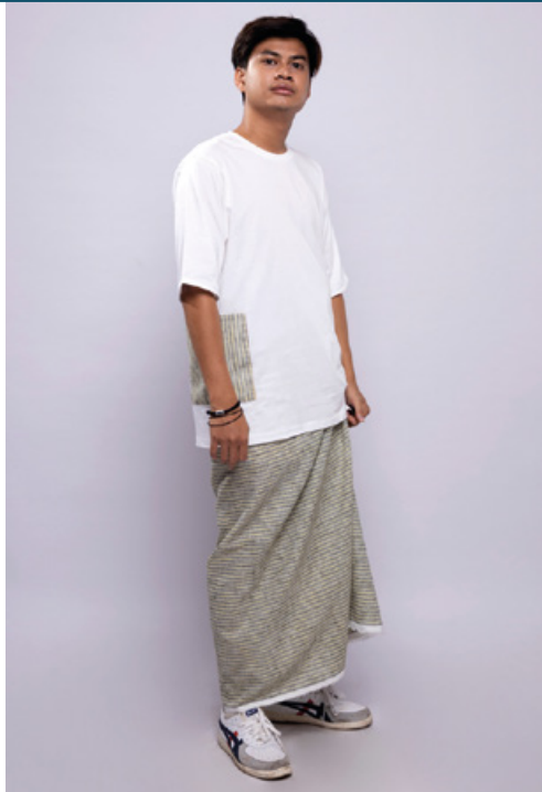
T-SHIRT 199.60 AED SARONG 207.26 AED