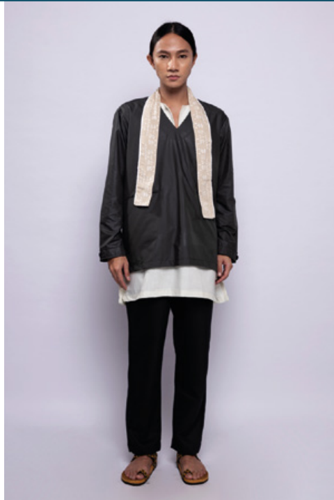
2 TOP PANTS MINI SHAWL 483.06 AED