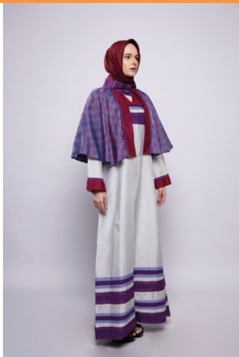
GREY AND PURPLE ABAYA PURPLE CAPE PURPLE CAPUCHON HIJAB 1121.50 AED