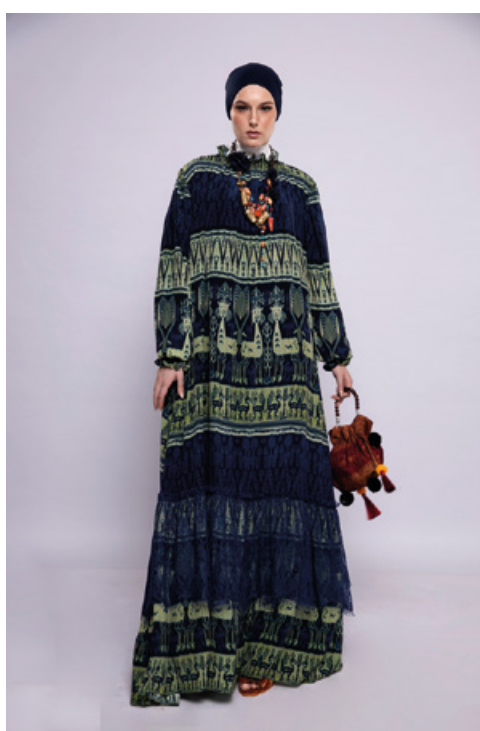
LOOK 2 (OUTFIT ONLY) 1500 AED