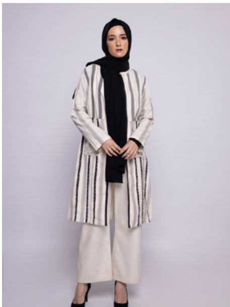
SHIRAT SABIN LONG OUTER SOLOK 300.47 AED