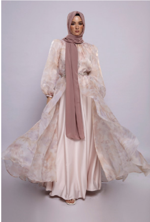
FAYE DRESS 303.37 AED