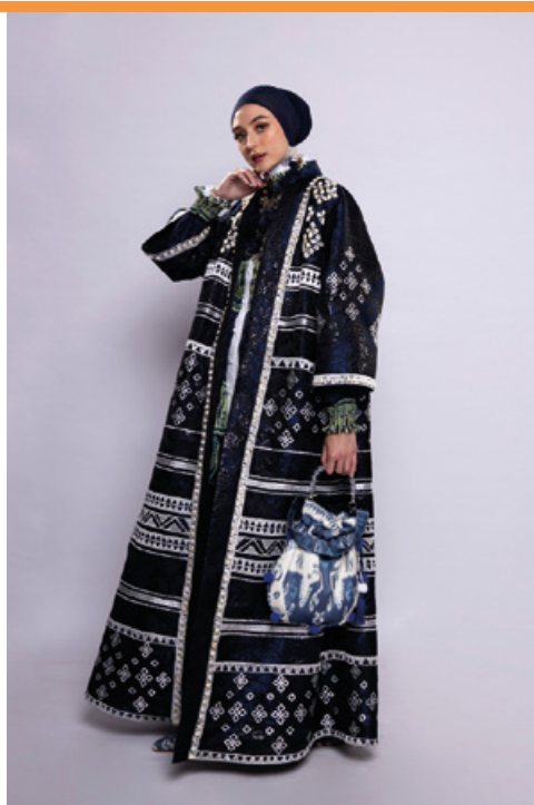
LOOK 5 (OUTFIT ONLY) 1700 AED