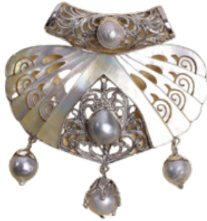
MERAK 1057.65 AED