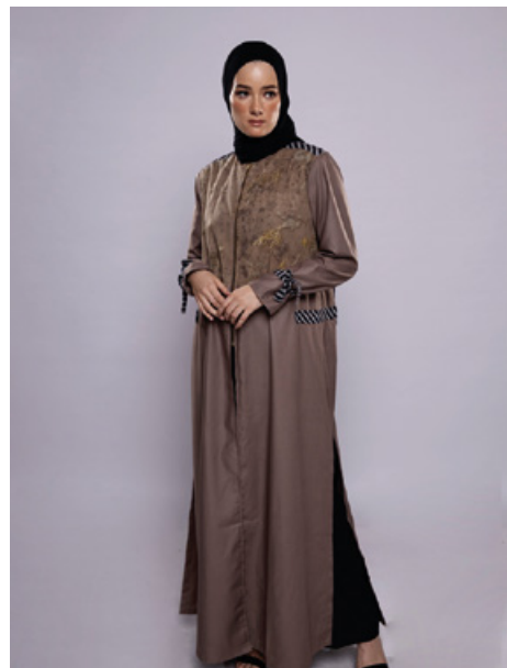
EHOPRINT LOOK 2 245.00 AED