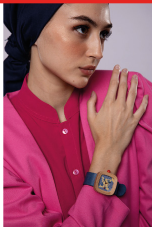
PALA MEGAMENDUNG BIRU