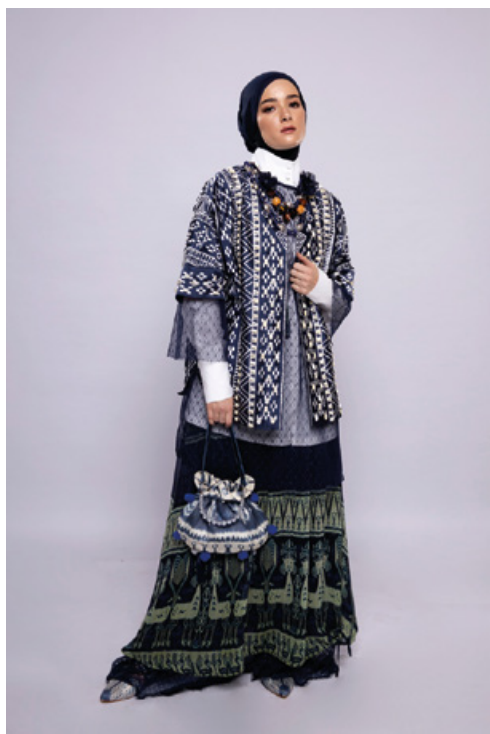
LOOK 1 (OUTFIT ONLY) 1500 AED