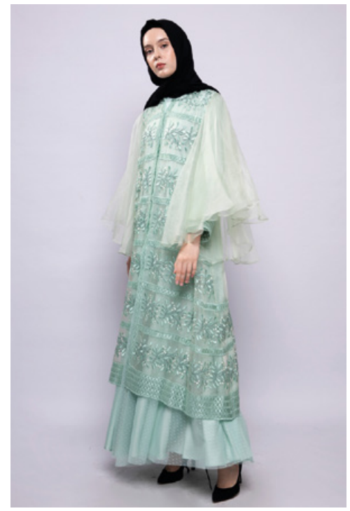
GREEN EMBROIDERED ORGANZA OUTER 1504.56 AED TULLE DRESS 483.06 AED