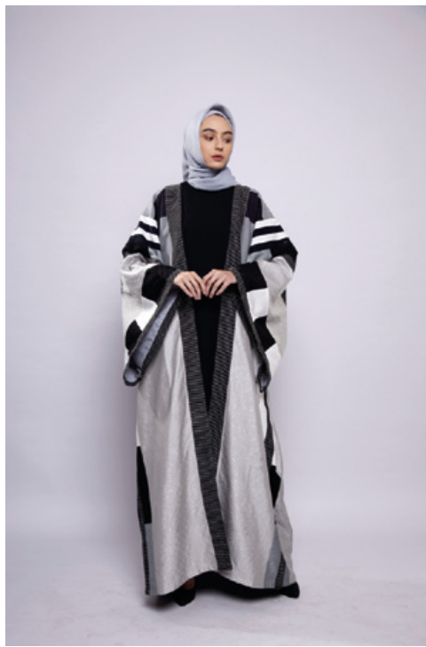
GREY LONG PATCHWORK OUTER WHITE ABAYA GREY SHAWL HIJAB 1759.93 AED