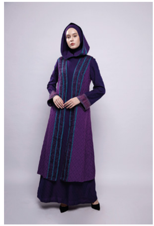
PURPLE ABAYA PURPLE LONG SLEEVES OUTER PURPLE CAPUCHIN HIJAB 1376.87 AED