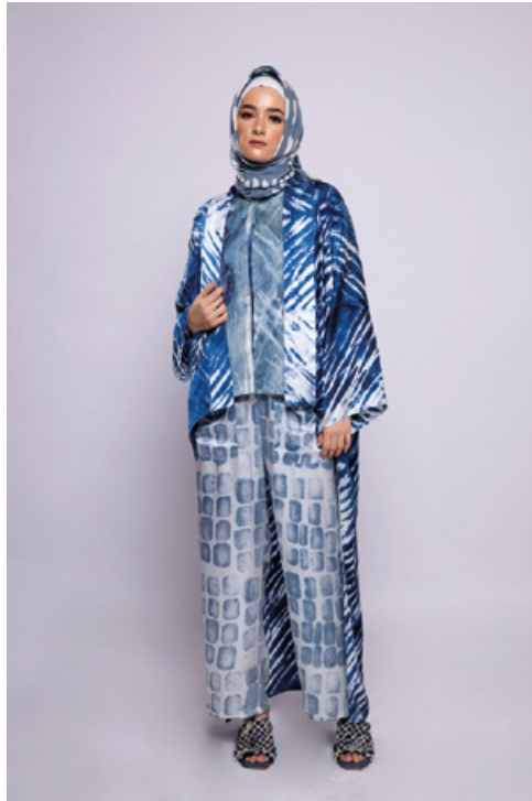
SLEEVES BLOUSE 674.59 AED LOOSE PANTS 546.91 AED OUTER WITH SHIBORI 802.28 AED LAWANG SEWU SCARF 202.15 AED MACRAME STYLE HEELS 431.99 AED