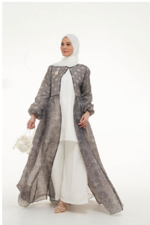
LANA OUTER DRESS 324.79 AED