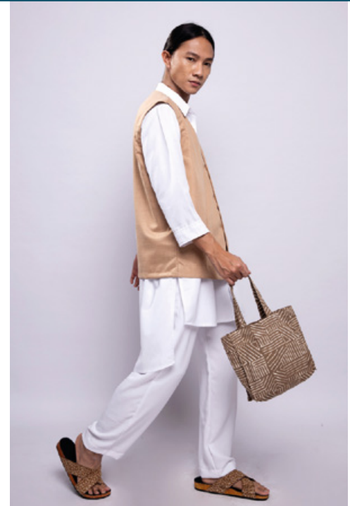
VEST KHAKI TOP KURTA WHITE WHITE LONG PANTS BATIK TOTE BAG 483.06 AED