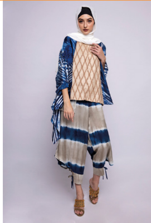
SLEEVELESS BLOUSE 674.59 AED ANKLE PUFF PANTS 546.91 AED OUTER 993.81 AED GUNNY SACK HEELS 444.76 AED