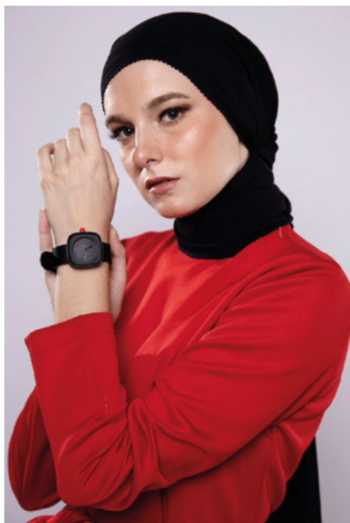
PALA MINI CEMANI