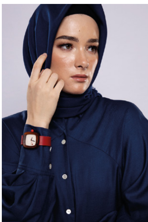
PALA MINI MERAH