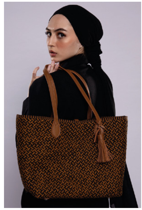
TOTE LUMBINI TETRIS