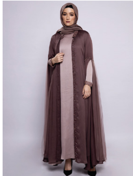
CREDENZA SILK TULLE SWAROVSKI 743 AED