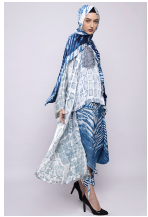
MANSET BLOUSE 993.81 AED LOOSE PANTS 546.91 AED KIMONO 993.81 AED SHIBORI SCARF 419.22 AED