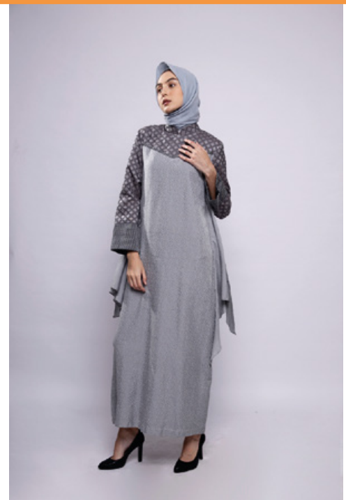
GREY ABAYA GREY SHAWL HIJAB 738.44 AED