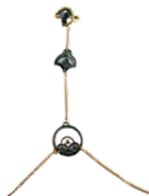
GARIS WAKTU - SET OF ACCESSORIS (EARRINGS, COLLAR BROOCH, RING & BRACELET) 738.44 AED