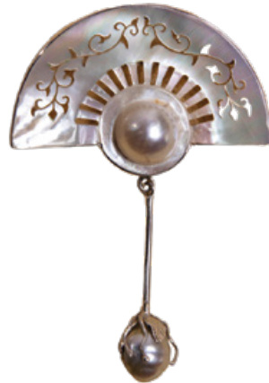
KIPAS 610.75 AED