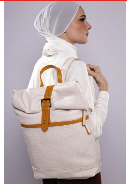
ROLL TOP MAULA BACKPACK