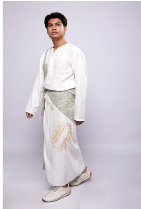
T-SHIRT 133.20 AED SARONG 207.26 AED