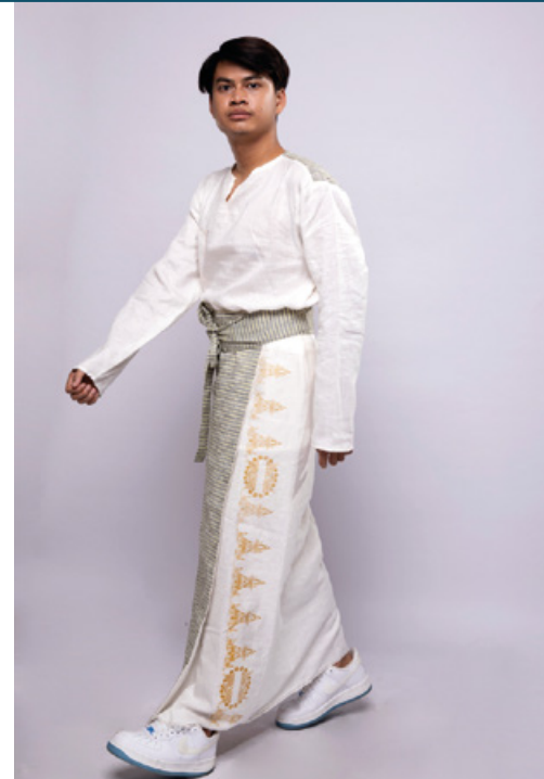
T-SHIRT 199.60 AED SARONG 207.26 AED