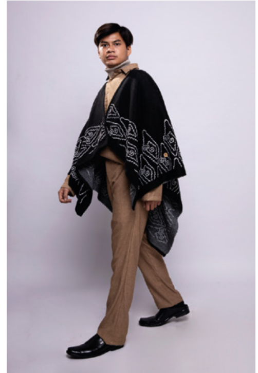
BERMOCK PONCO MEGA MENDUNG BLACK 431.99 AED