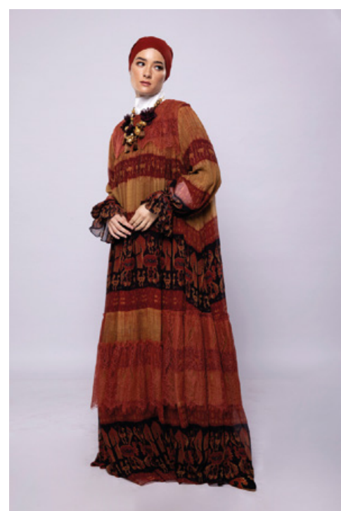
LOOK 3 (OUTFIT ONLY) 1500 AED