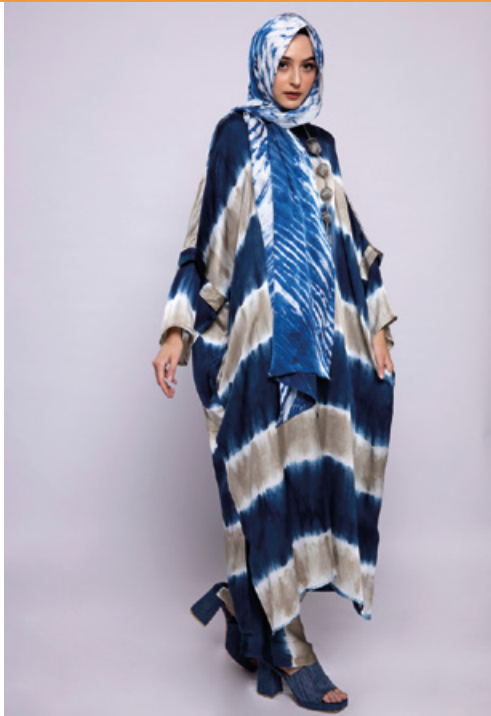
TUNIC 866.12 AED ANKLE PUFF PANTS 546.91 AED SHIBORI SCARF 546.91 AED