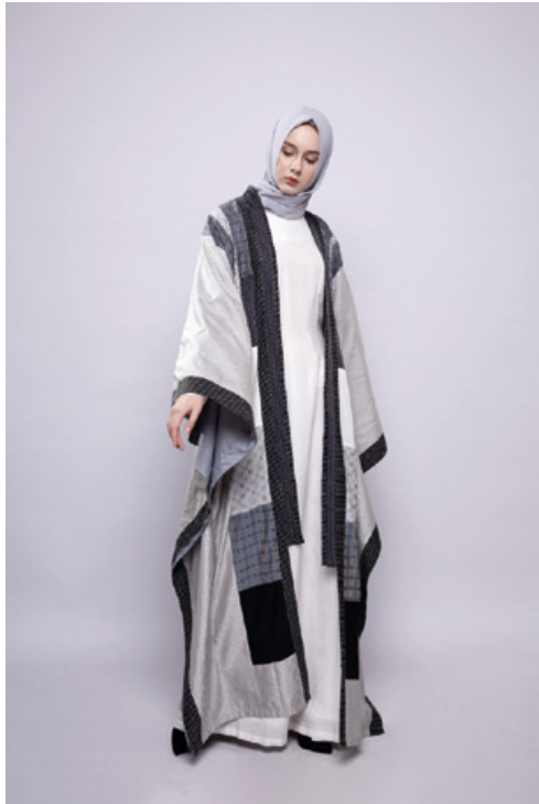
GREY LONG PATCHWORK OUTER WHITE ABAYA GREY SHAWL HIJAB 1759.93 AED