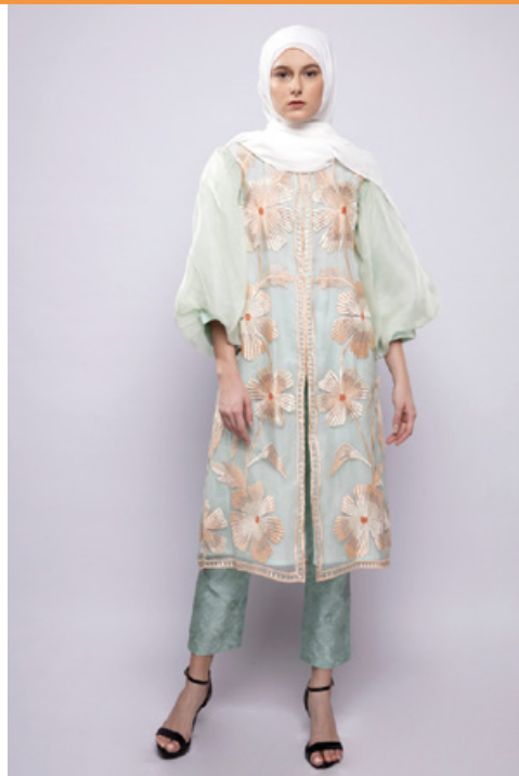
MINT GREEN EMBROIDERED ORGANZA OUTER 1759.93 AED GREEN WEAVE PANTS 419.22 AED