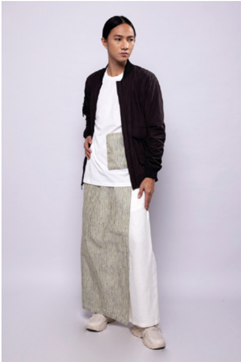
T-SHIRT 133.20 AED JACKET 176.61 AED SARONG 189.38 AED