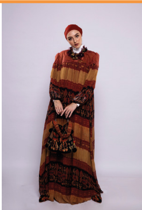
LOOK 4 (OUTFIT ONLY) 1500 AED