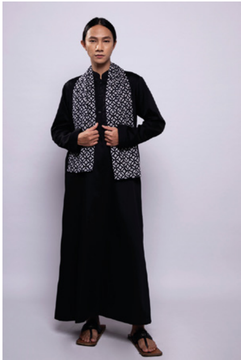
THOBE BLACK MINI SHAWL BATIK 355.37 AED