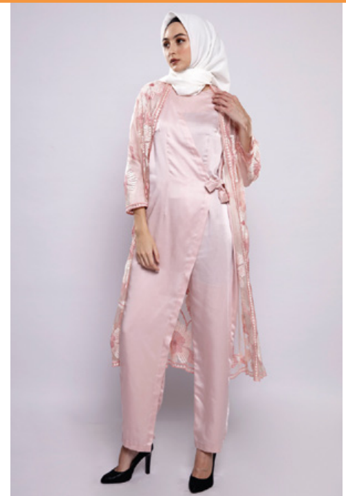
PINK EMBROIDERED ORGANZA POPPY OUTER 1504.56 AED SATEN JUMPSUIT 483.06 AED