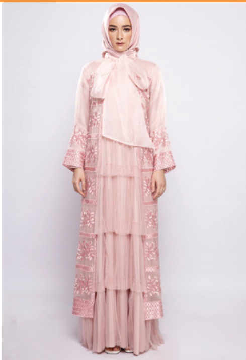
PINK EMBROIDERED ORGANZA OUTER 1504.56 AED LONG TULLE DRESS 483.06 AED SATEN HIJAB 151.07 AED