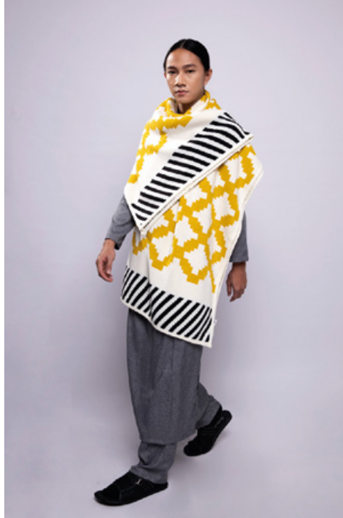
BLANKET BERMOCK BLANKET KAWUNG YELLOW 412.83 AED