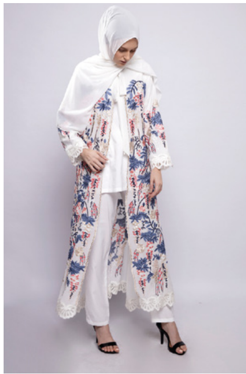
WHITE EMBROIDERED WISHTERIA OUTER 1376.87 AED WHITE TOP 291.53 AED LONG PANTS 291.53 AED