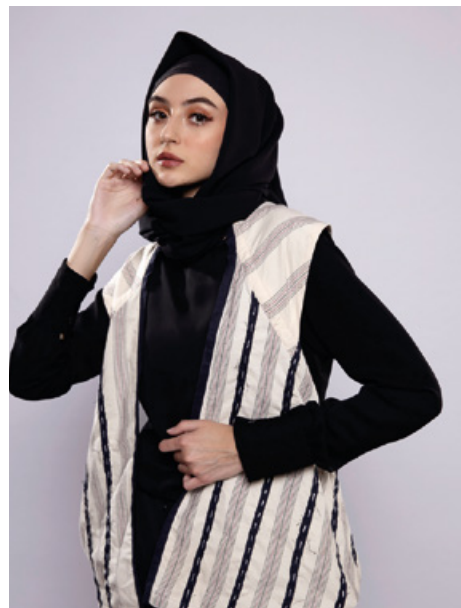
SHIRAT SABIN OUTER TENOEN SOLOK 226.67 AED