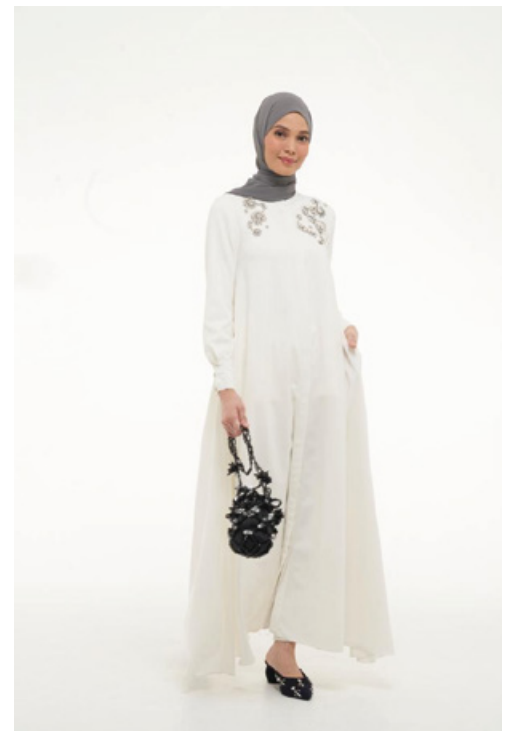
BELLE DRESS 446.82 AED