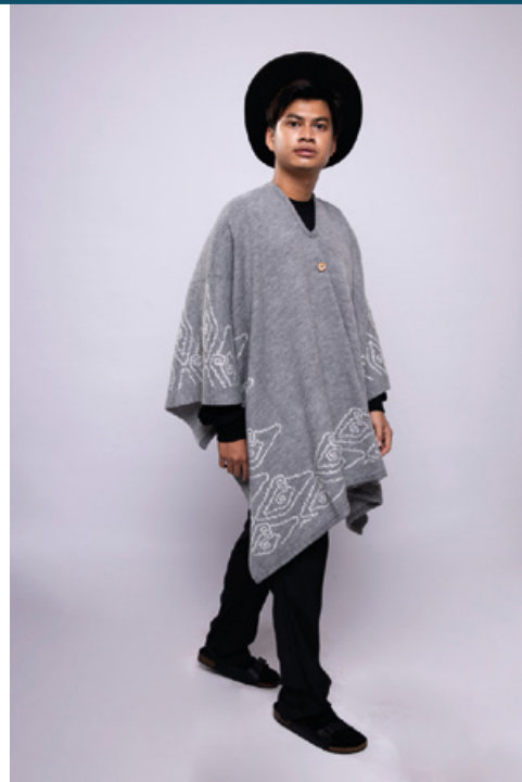
BERMOCK PONCHO MEGAMENDUNG GREY 424.33 AED