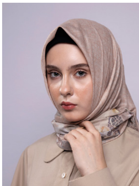
ANGGREK BULAN KALIMANTAN NUDE 179.5 AED