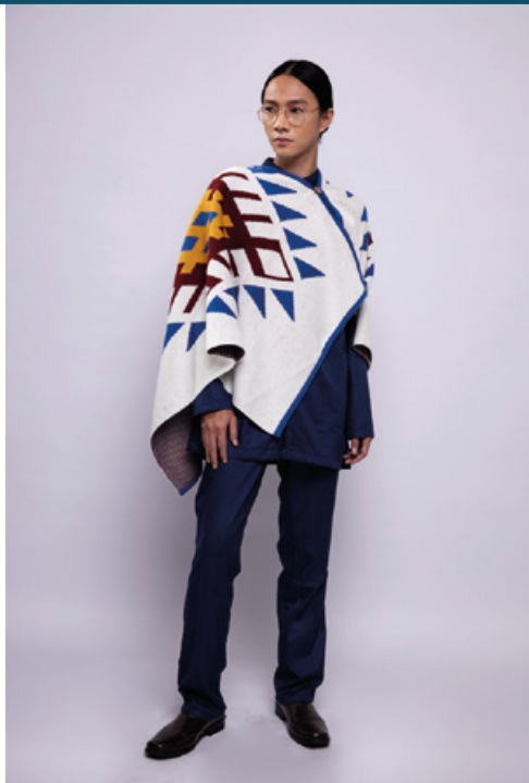
BERMOCK PONCHO SONGKET WHITE 462.63 AED