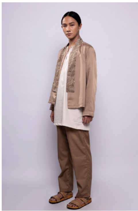
BLAZZER KHAKI TOP CREAM PANTS CREAM MINI SHAWL BATIK 483.06 AED