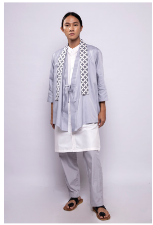
OUTER LIGHT GREY TOP WHITE PANTS LIGHT GREY MINI SHAWL BATIK 483.06 AED