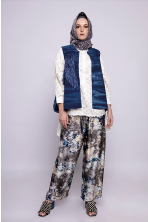
MANSET BLOUSE 738.44 AED LOOSE PANTS 546.91 AED SLEEVES OUTER 802.28 AED SHASIKO SCARF 202.15 AED MACRAME STYLE HEELS 431.99 AED