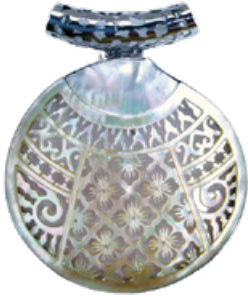
SEKAR ARUM 802.28 AED