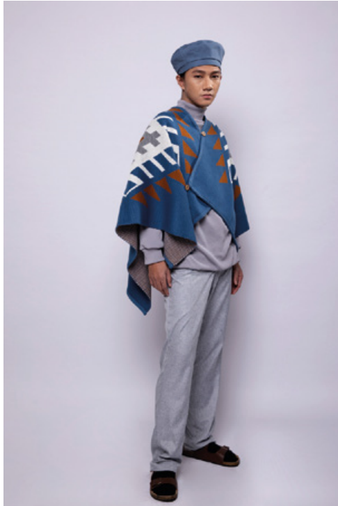
BERMOCK PONCHO SONGKET DENIM BLUE 414.11 AED