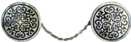
SULUR ASIH 802.28 AED