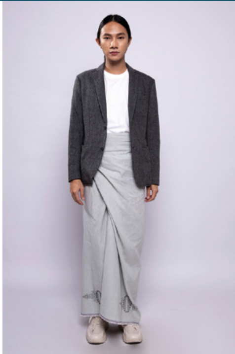
T-SHIRT 125.54 AED BLAZER AND SARONG 207.26 AED