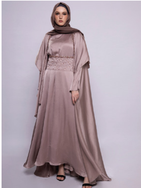
CREDENZA SILK SWAROVSKI 743 AED