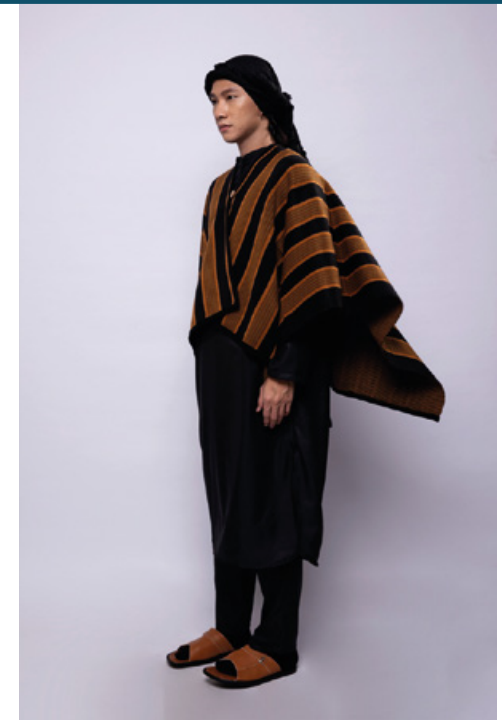
BERMOCK LURIK 392.40 AED