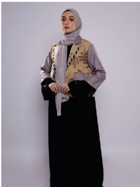
ECOPRINT LOOK 1 232.00 AED