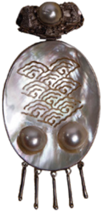
MEGAMENDUNG 738.44 AED