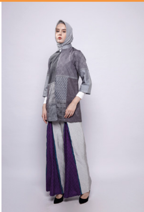
GREY PATCHWORK OUTER GREY AND PURPLE CULLOTE PANTS GREY SHAWL HIJAB 866.12 AED