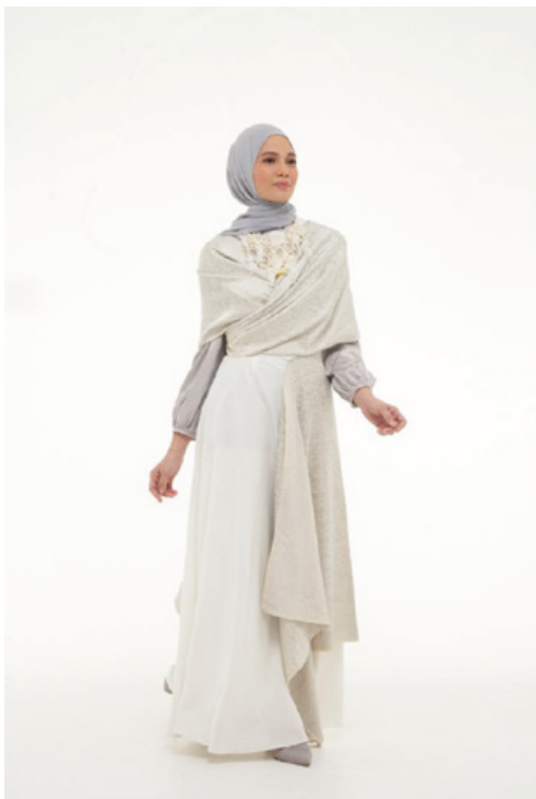
EIRA SET 2283.69 AED