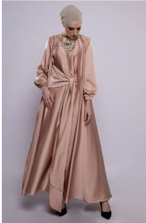
HELENA DRESS 323.83 AED